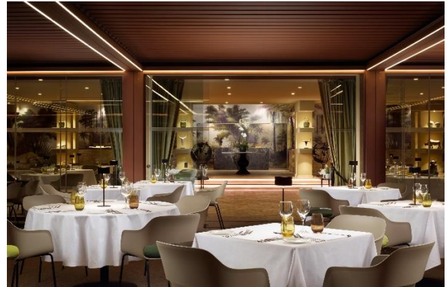
La Palma Restaurant